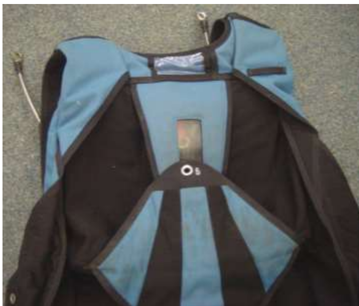
Fig. no. 2 – full view of the reserve parachute container